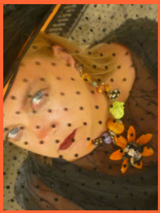
woo hooo witchy woman.